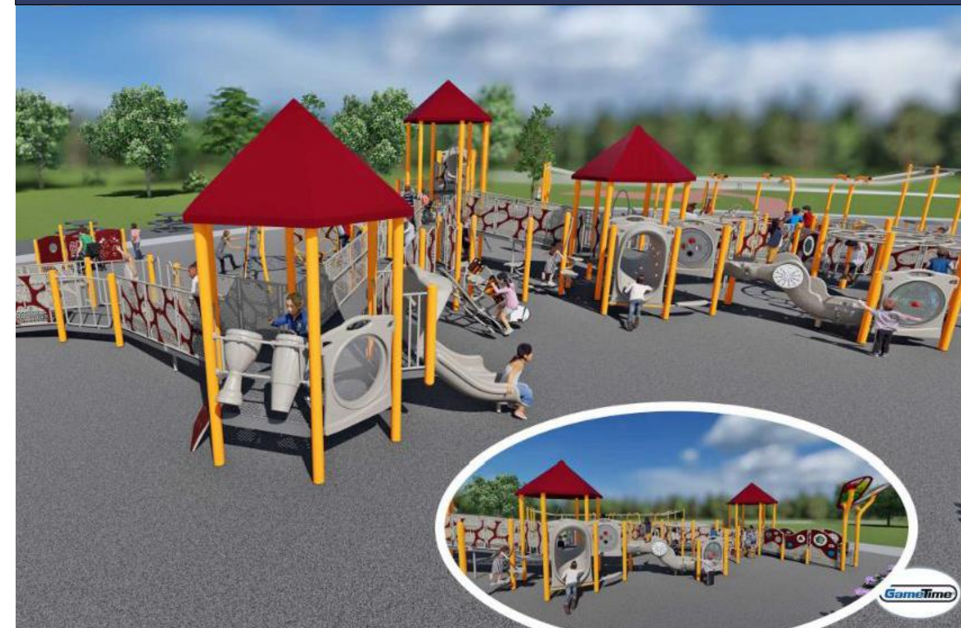
PLAYGROUND VIEW 2