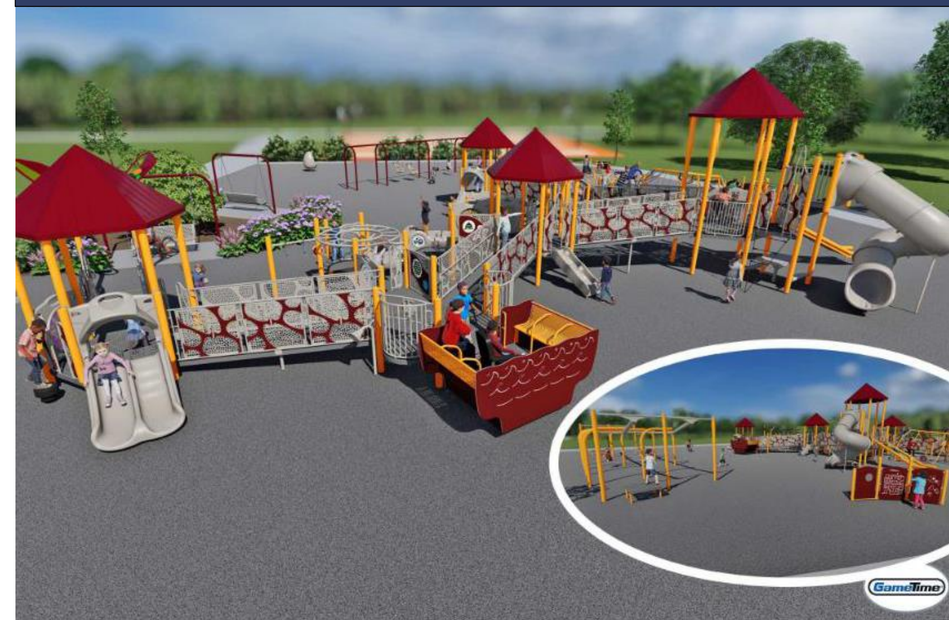
PLAYGROUND VIEW 5