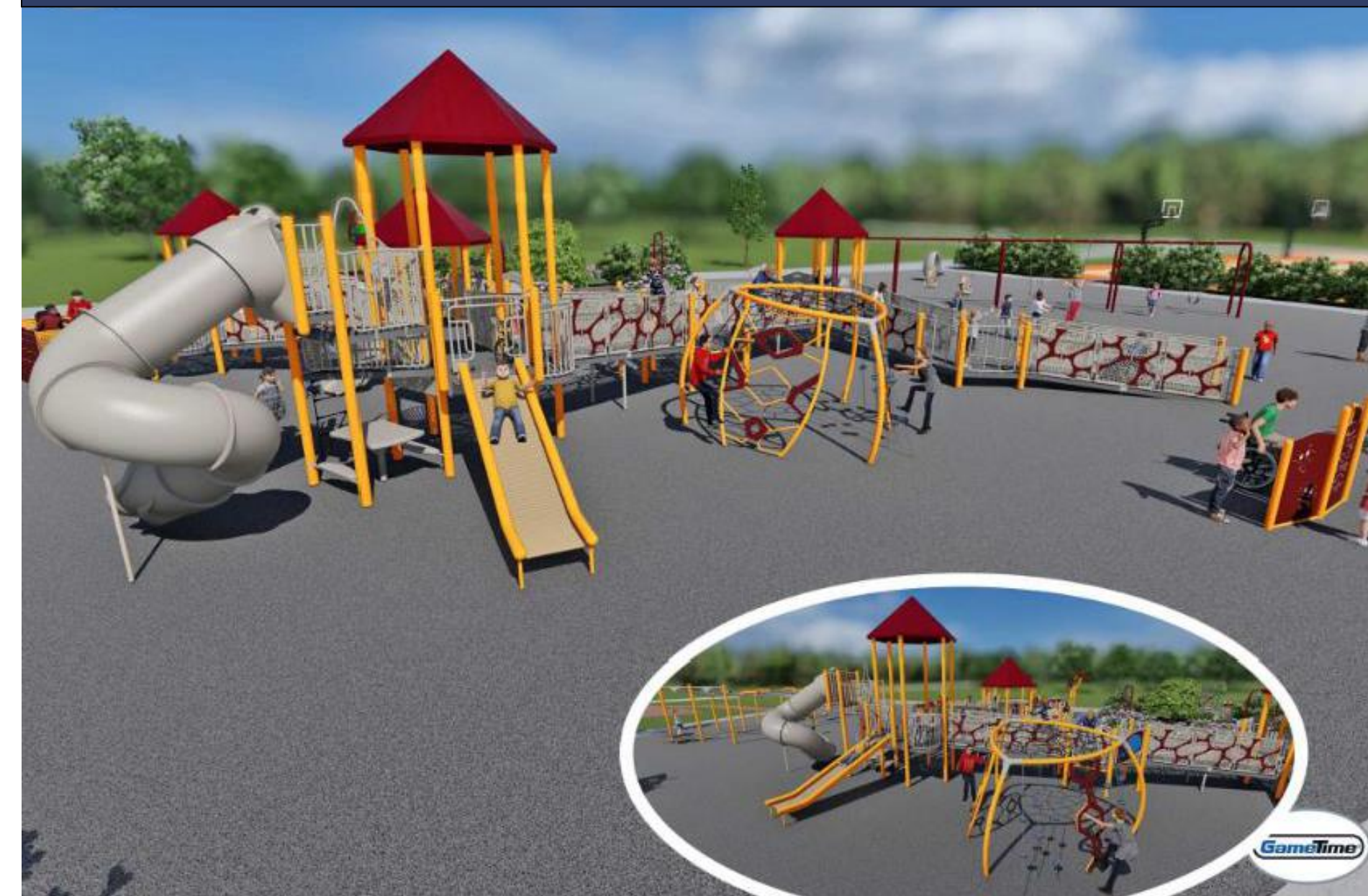
PLAYGROUND VIEW 1