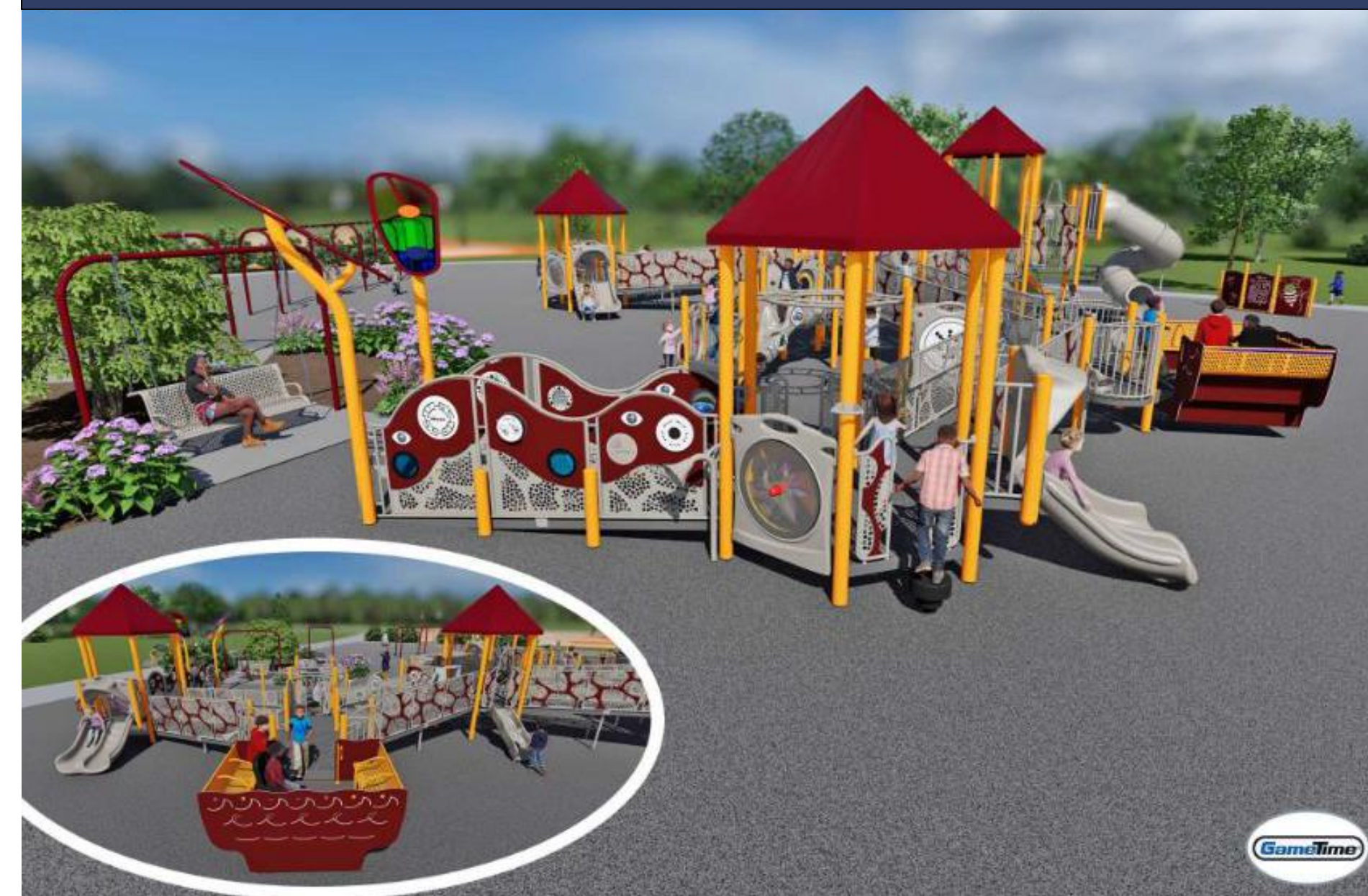
PLAYGROUND VIEW 4