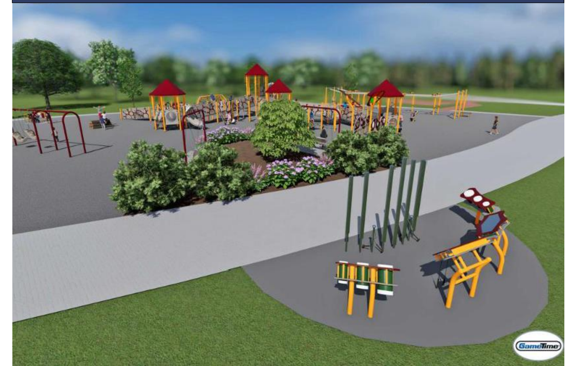
PLAYGROUND VIEW 3